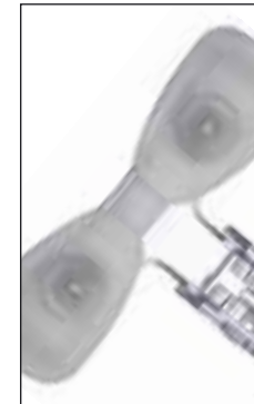
Flexible, one-piece forehead pads conform to the shape of your face