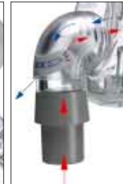
Unique air vent design reduces noise by directing the flow of air that is being inhaled and exhaled