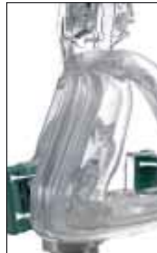
Soft Mirage dual-wall cushion optimizes seal and minimizes pressure on the bridge of your nose

The Ultra Mirage has been proving it for over five years—quietly. The Ultra Mirage II continues to redefine what you can expect from the leading nasal mask in the market.