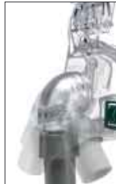
360° elbow rotation lets you choose the most convenient tube position